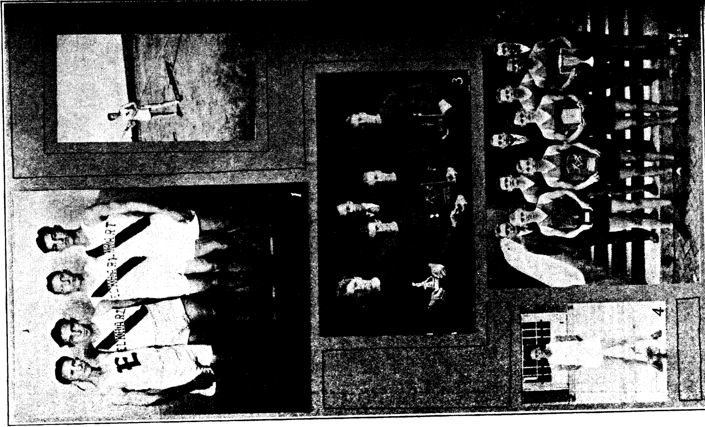
First Place Winners at State Track Meet (Description on Page 64)