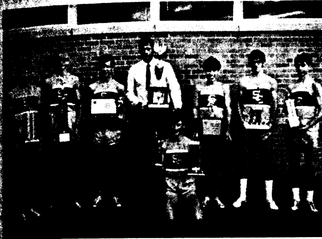
Wichita-Southeast High School