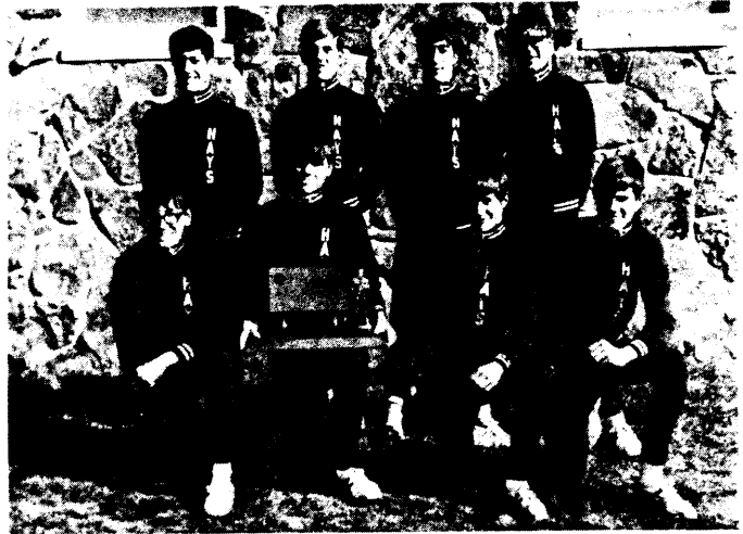
Hays High School