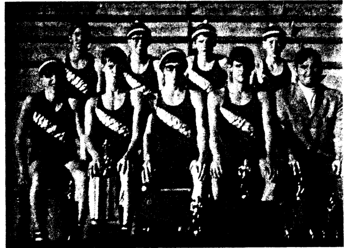
Oakley High School