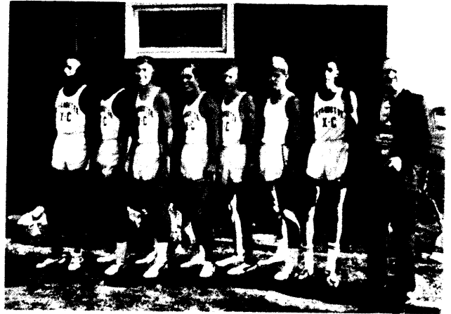
Wyandotte High School