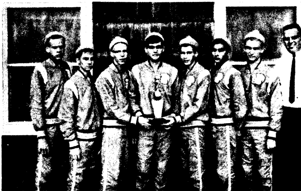
Sacred Heart High School of Salina