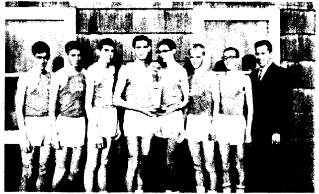
Wichita East High School